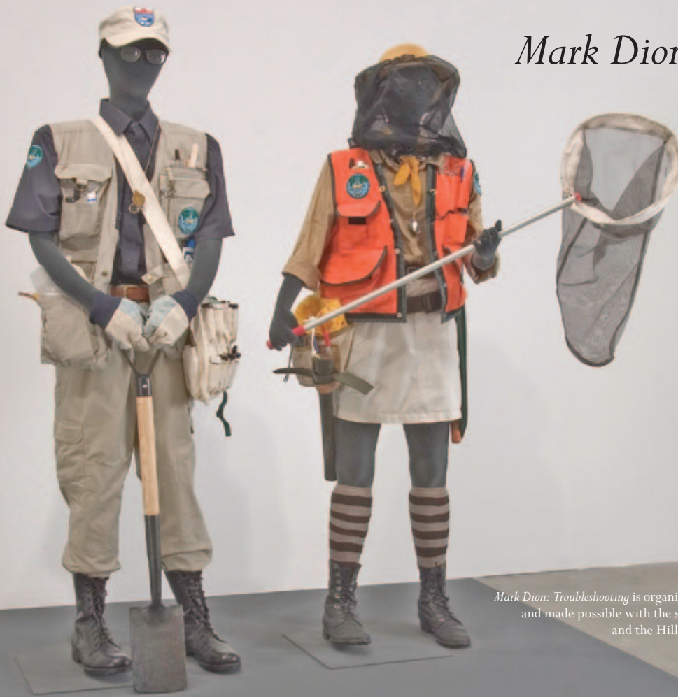
Mark Dion, The South Florida Wildlife Rescue Unit: The Uniforms , 2006

Mark Dion: Troubleshooting is organized by the USF Contemporary Art Museum, Tampa; and made possible with the support of the Arts Council of Hillsborough County and the Hillsborough County Board of County Commissioners.