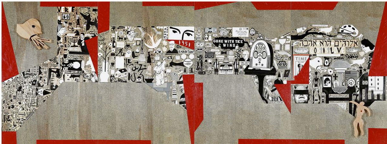
Deborah Grant, Crowning The Lion and The Lamb , 2013 oil, acrylic, enamel and paper on birch panel, 72 x 192 x 4 inches Courtesy of the artist and Steve Turner Contemporary, Los Angeles, CA photo: Will Lytch/Graphicstudio

Tampa, September 5, 2014 – The USF Contemporary Art Museum is pleased to present the exhibition Making Sense: Rochelle Feinstein, Deborah Grant, Iva Gueorguieva, Dona Nelson open September 27 through December 12, 2014.