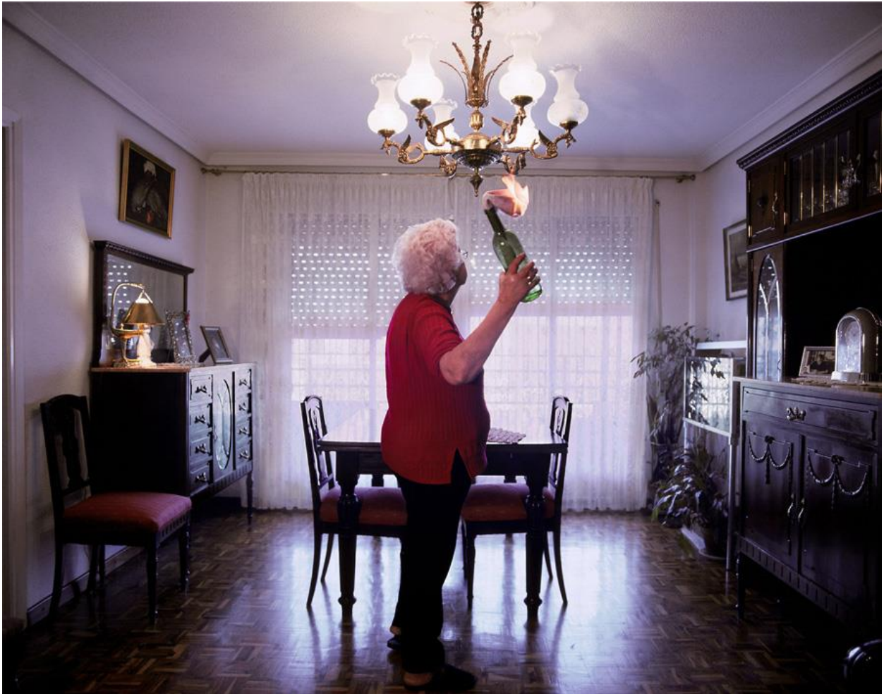
Cristina Lucas, La Anarquista (The Anarchist) , from the series The Old Order , 2004.