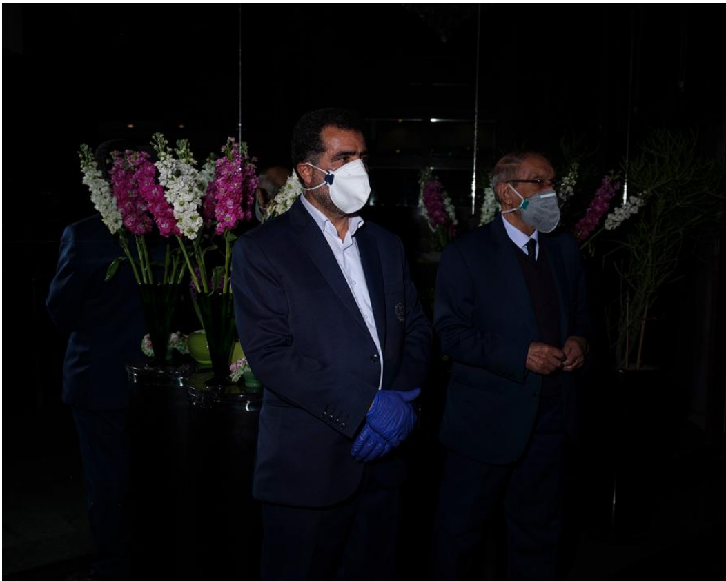
The concierges of my apartment building at first said they didn't believe in masks and gloves. They said the whole Corona story was a ploy by the Iranian government to distract people. But after a while they started appearing with masks and gloves, now saying the virus was designed by America.